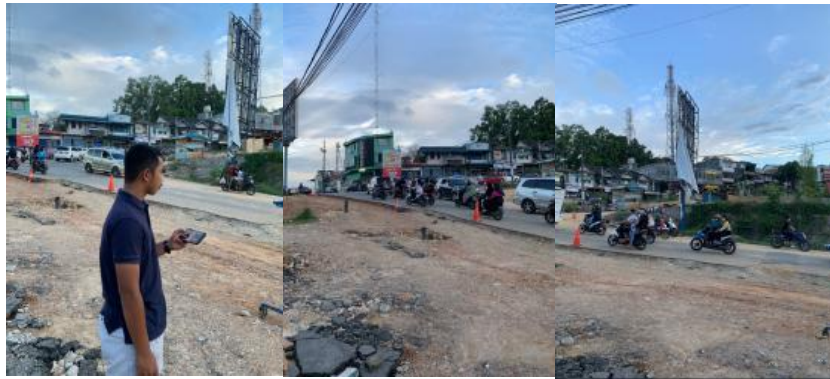
Figure 2. The survey activity

The value of the degree of saturation is theoretically between 0 to 1. This means that if the value is close to 1, the road conditions are close to saturation. Meanwhile, if the degree of saturation is far from the value of 1, then the road condition is not saturated. The analysis carried out in this study is to calculate the volume of traffic flow in Bengkong. So from this analysis, the degree of saturation (DS) will be obtained.