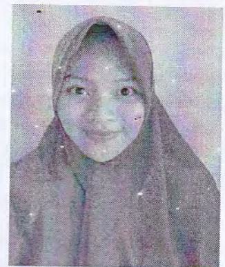
Ice Nasyrh Noor Committee