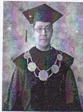
Willy Arafah Committee