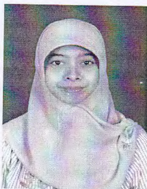
Tiara Puspa Committee