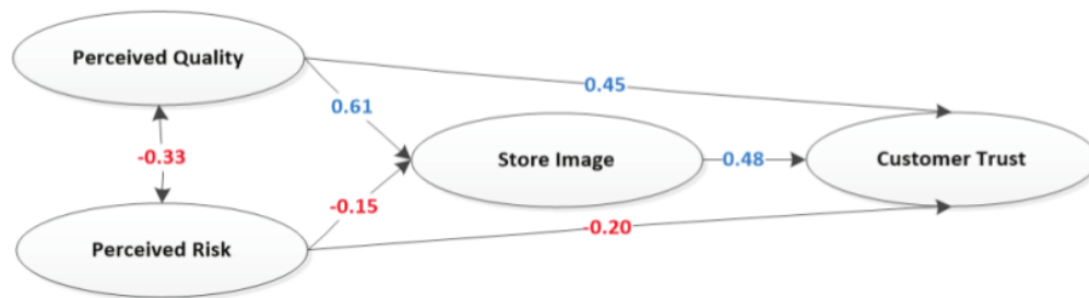
Figure 2. Model of Study Result

Factors of each indicator determined the most dominated measurement which formed the variable research (Malhotra, 2010). It is also supporting the form of correlation from each research variable. On customer perceived quality of products, all of measurements support in form of perceived quality, but the most dominant of Loading Factors value is on organoleptic characteristic . The characteristic of organic products becomes the important attention to customer, besides other supports that is existed in its environment (Othman & Rahman, 2014). While on perceived risk, the most considered risky for customer in financial risk measurement, remembering price becomes striking distinction (D'Alessandro et al., 2012). If it is reviewed from customer trust value, reliability and trustworthy are two of very important values. Customer will be more believe in reliability and the ability of organic products (Yu-shan Chen, 2010). Whereas, a supporting from store image that has a major role is store atmosphere because it is something that can be felt and affect the customers' psychology on supermarket retail (Gillani, 2012).