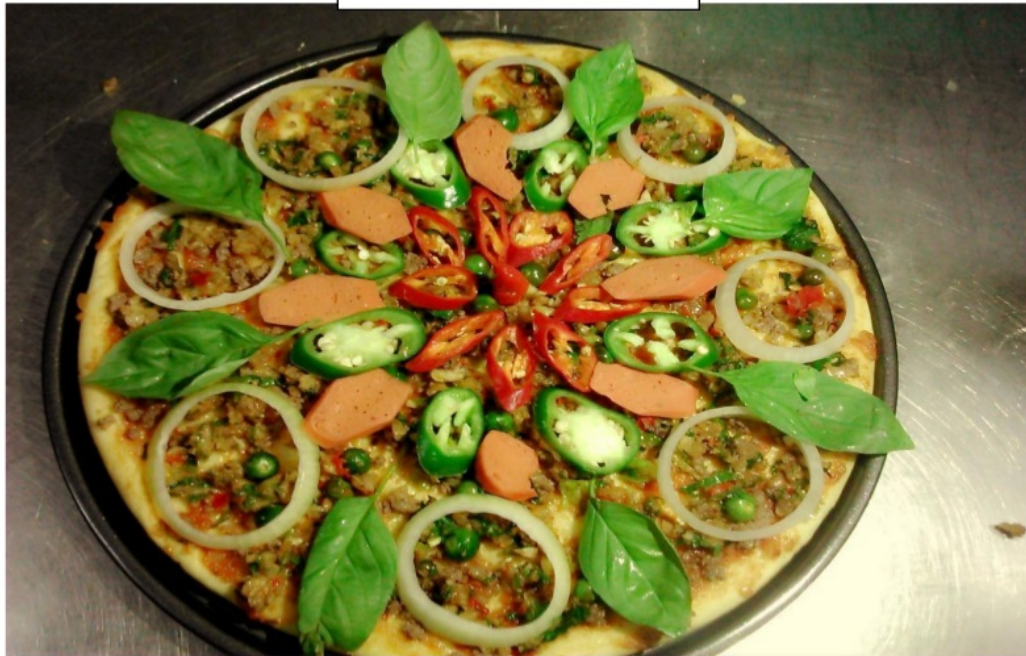
Picture 3. Seasoning of oncom and topping ingredients