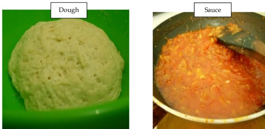
Picture 1. Flatbread Dough and Sauce

It can be tried to use some kinds of topping from several traditional culinary of each regions in Indonesia, such as with topping of opor, sambel goreng ati or krecek, rendang, balado, rica-rica, and etc.