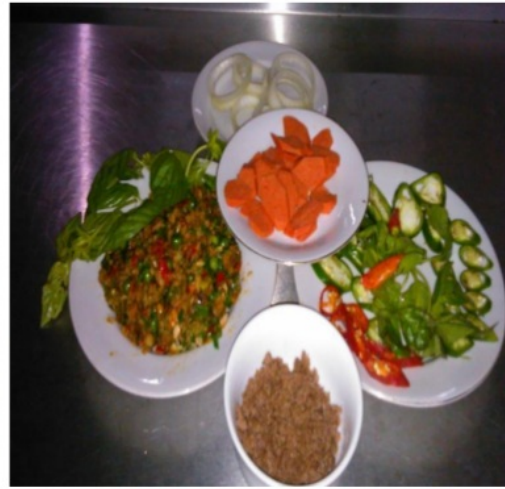
Picture 2. Seasoning of oncom and topping ingredients