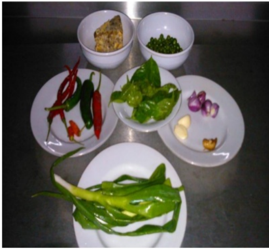
Ingredients of tumis oncom and spices