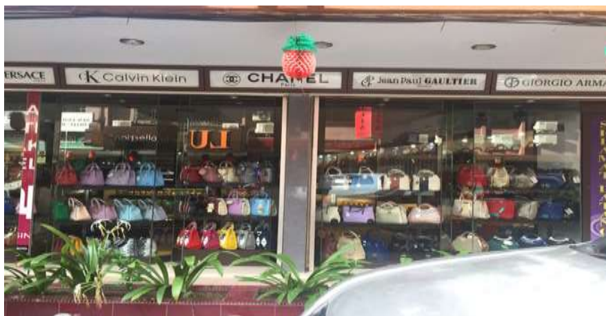
Figure 1. The sales of KW bags with well know international brands

The results of questionnaires distributed to 135 buyers are shown by Table 1.